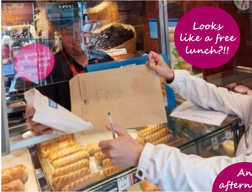
Looks like a free lunch?!!