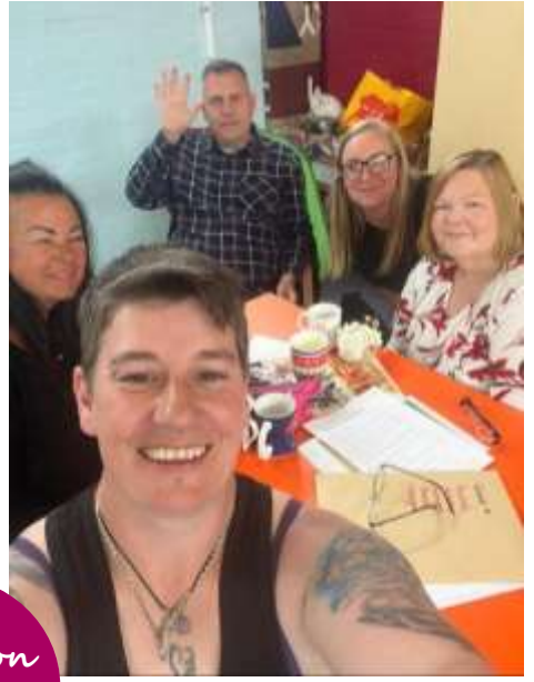
An afternoon of quizzing fun