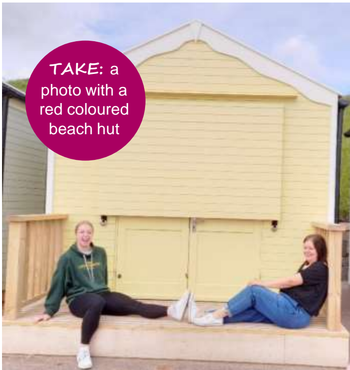
TAKE: a photo with a red coloured beach hut